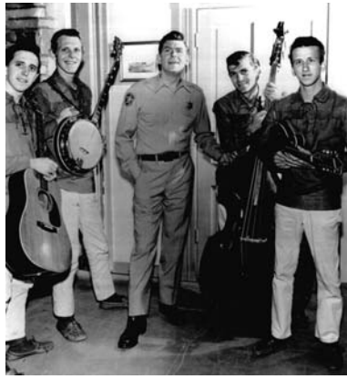
The Dillardards with Andy Griffith

Contributors include Grassroots on WMUK-Radio, and members and friends of the Great Lakes Acoustic Music Association.