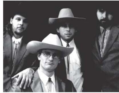
Honest D & the Steel Reserve